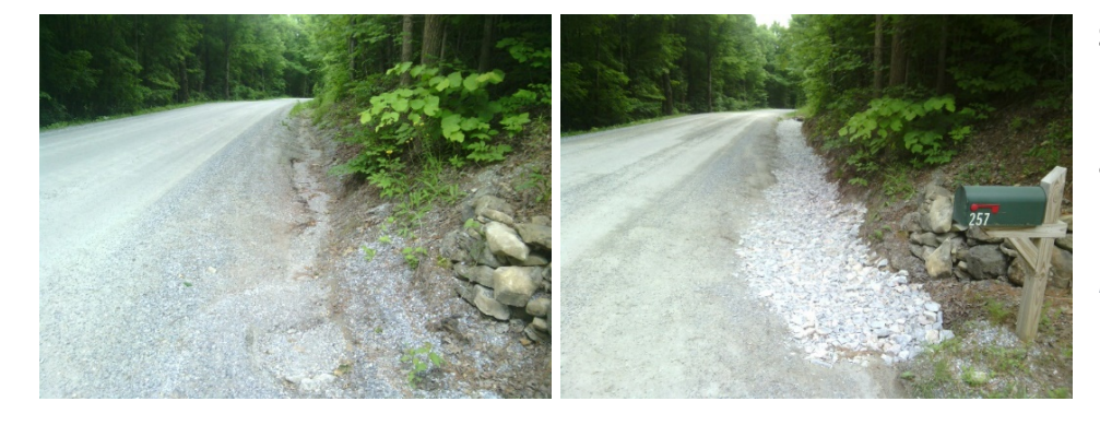
Sample Project: Dorset Hill Road, Dorset, VT, Before and After