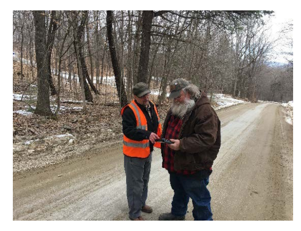
Site visit in Addison County

The project has been successful in part because of its strong partners each serving a unique role in the project. Vermont Department of Environmental Conservation staff provided administrative oversight and technical assistance regarding the best management practices. Regional Planning Commissions worked with each individual municipality to identify the best project sites, plan for best management practices, and verify construction. Northwest Regional Planning Commission served as the fiscal agent and overall program manager. VTrans staff in the Better Roads program and at the District offices provided additional expertise and technical assistance. Municipalities completed construction with municipal staff or through contractors.