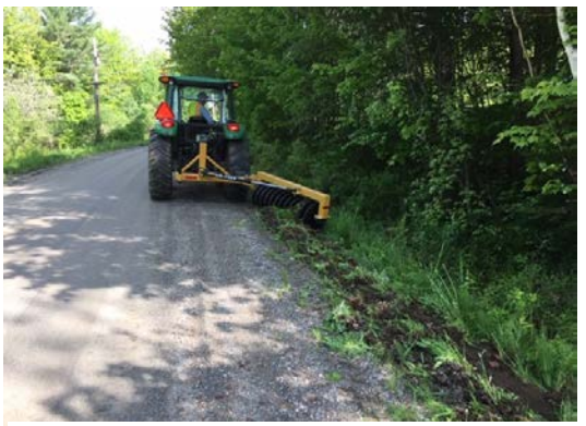
Tractor mounted shoulder disc equipment in use-Town of Johnson